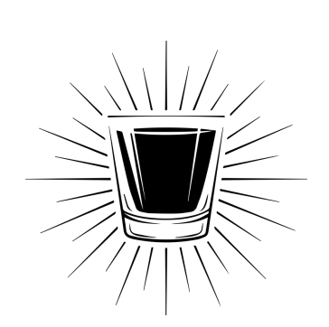
BLACKBIRD $8 AMARO MONTENEGRO. JAMESON